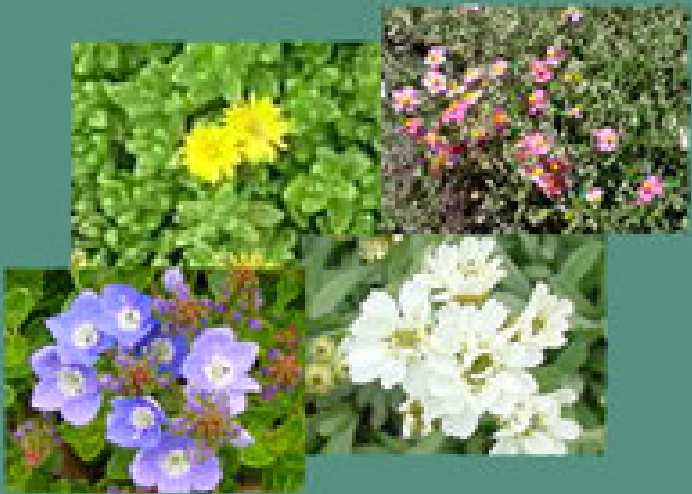
Sun-loving groundcovers include yellow iceplant, sun rose, Greek yarrow, and Turkish Veronica